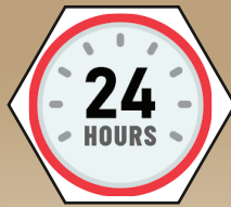
24 HOURS DRYING TIME