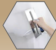
SUITABLE FOR GYPSUM & SAND CEMENT PLASTER