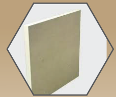
LARGE COVERAGE AREA