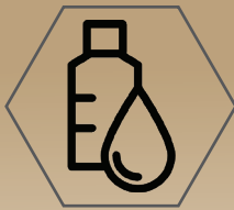
COARSE & LIQUID PARTICLE BONDING